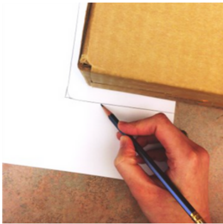
Step 1: Trace box onto paper