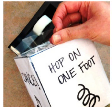
Step 4: Tape over edges