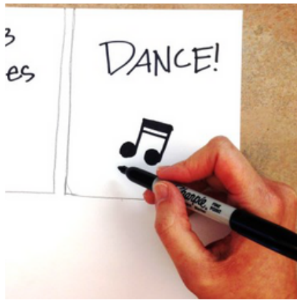
Step 2: Write an action & picture