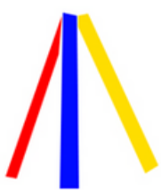
Start with three strands; these colors are examples.