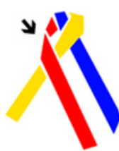
Red over yellow (left strand becomes center strand).