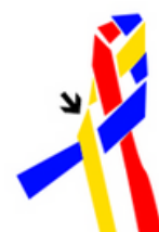
Yellow over blue (left strand becomes center strand).

Pattern: Yellow, red, blue, yellow, red, blue, etc. OR RIGHT, LEFT, RIGHT, LEFT, etc.