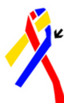
Blue over red (right strand becomes center strand).