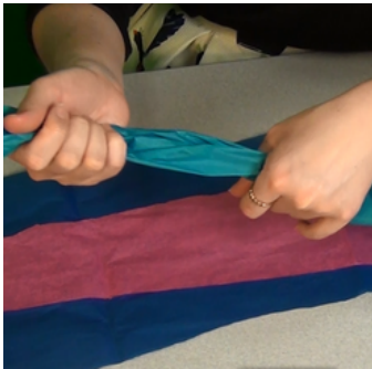
Crunch the paper strips long ways to make a braid-able strand.