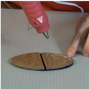
Glue cardboard to felt; leave space between halves.