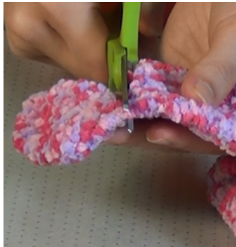
Cut off toe area of sock.