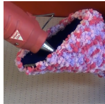
Roll sock's edges over oval's edges; glue in place.